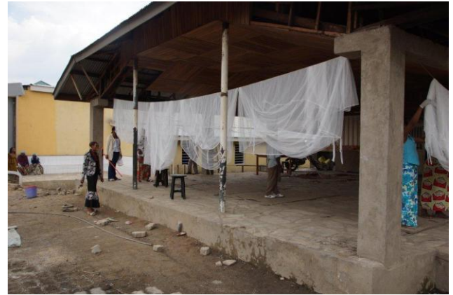
Drying the treated mosquito nets made for sale from donated raw materials from Sonic, an income generating program

Sonic staff continue to travel to Goma at regular intervals to assist the hospital provide services in one of the world's most disadvantaged areas. Sonic and its staff can well be proud of the support that we have provided to this worthwhile cause which has helped to establish this hospital as one for the most well regarded within the Democratic Republic of the Congo.