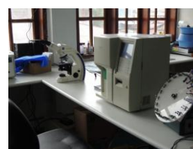
Haematology KX21N Analyser donated by Sonic Germany