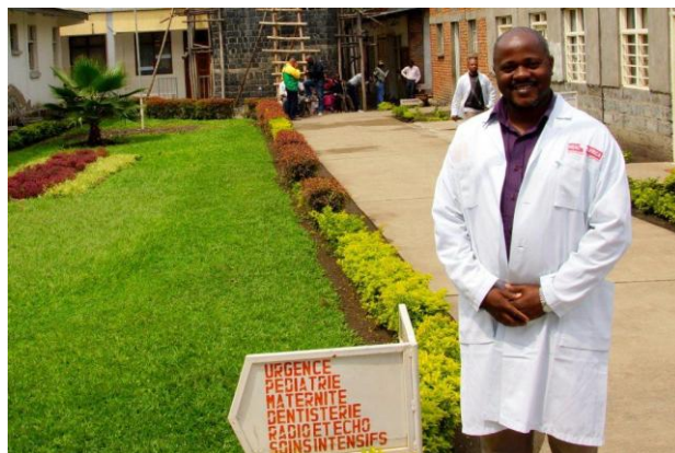
Medical Director of the laboratory