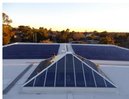
Solar Panels – 95 Epping Road, Macquarie Park