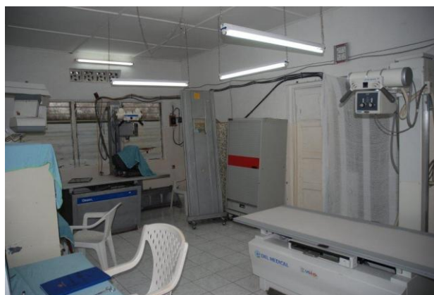
The radiology department at the hospital - all equipment and training supplied by Sonic Healthcare