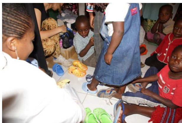
Children trying on footwear donated by staff of Sonic Healthcare