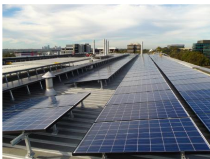
Solar Panels - Sonic headquarters