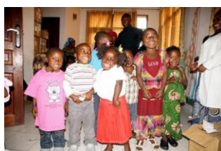
Children wearing clothes donated by Sonic staff