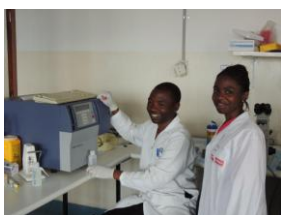
Becton Dickinson FACS analyser for diagnosing and monitoring HIV patients

The patients benefiting from this new analyser are predominantly children as HEAL operates one of the largest HIV Positive children’s programs in central Africa with over 1,000 children enrolled and over 700 receiving antiretroviral (ARV) treatment. This program is funded by the Clinton Foundation and Global Strategies for the Prevention of HIV. Sonic has not only become a partner with these groups in the diagnosis of this terrible disease but has also, through generous donations of clothing from Sonic staff across Australia, been able to provide clothing, school equipment and other basics to the families of these children. Many of these children are being cared for by grandparents, other relatives or even neighbours as their parents in many cases have already succumbed to HIV.